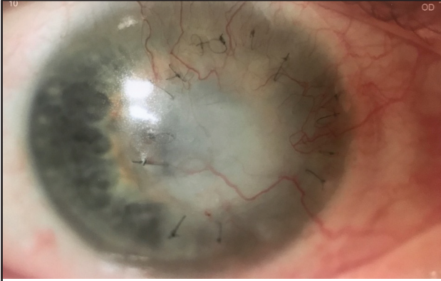
Fig. 5. Image of Patient C.'s eye at 3 months after surgery. The therapeutic transplant is semi-transparent with grown-in vessels from the limbus; the surface of the transplant is epithelized.