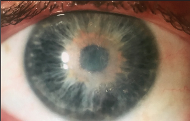
Fig. 7. Image of Patient C.'s eye at 11 months after surgery. Cloud-shaped corneal opacity is observed; the surface of the transplant is epithelized; the vessels are emptied.