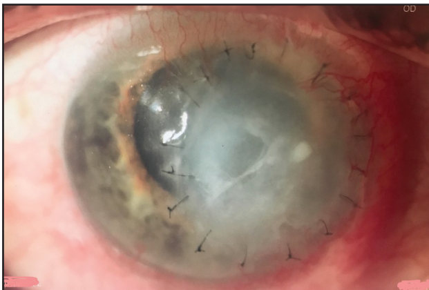
Fig. 3. Image of Patient C.'s eye at 20 days after surgery. The therapeutic transplant is semi-transparent and moderate swelling of the stroma is seen.