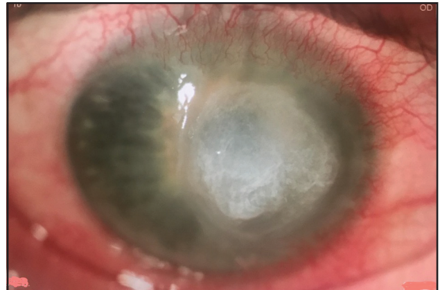
Fig. 2. Image of Patient C.'s eye before surgery. Ulcer of the cornea and a thinning of the stroma.