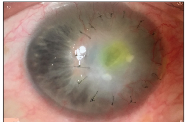
Fig. 4. Image of Patient C.'s eye at 1.5 months after surgery. Erosion of the therapeutic transplant can be seen.